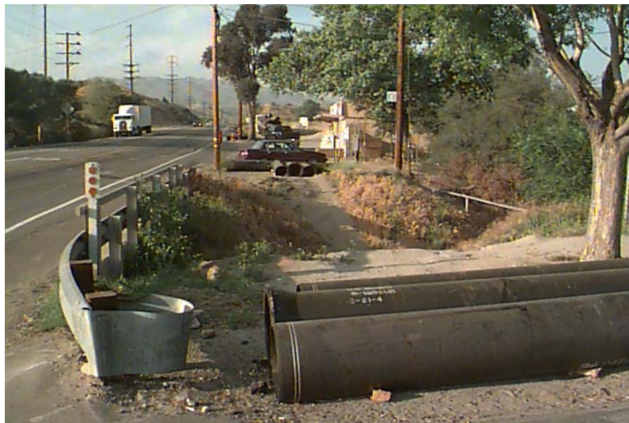
Photograph 1. Ephemeral drainage crossing site along Sierra Highway. View east/northeast. 8 May 2001.

The NCWD Vasquez Water Main, which originates from an existing water main at the corner of Sand Canyon and Soledad Canyon Roads, will be installed under existing roads (Sand Canyon Road, Sierra Highway, and Vasquez Canyon Road) except in three locations where the water main will cross natural watercourses, including Mint Canyon Creek. The Mint Canyon Creek crossing will involve trenching through the creek bed a few feet upstream from the Vasquez Canyon Road bridge. The remaining two water main crossings, which cross over two ephemeral drainages, will span the drainages and will not involve any soil disturbances within the channels.