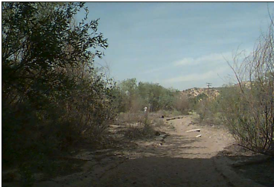
Photograph 5. Cottonwood-Willow Riparian Woodland in Mint Canyon Creek upstream of Vasquez Canyon Road bridge. View ENE. 15 May 2001.

The cottonwood-willow woodland in the vicinity of the project area includes three important canopy contributors: Salix exigua (Narrow-leaved Willow), S. lucida ssp. lasiandra (Shining Willow), and Sambucus mexicana (Blue Elderberry). Fremont Cottonwood-Arroyo Willow Series also includes a sparse shrub stratum of associate species, such as Artemisia californica , A. tridentata , Baccharis salicifolia (Mulefat), Nicotiana glauca (Tree Tobacco), and Senecio flaccidus var. douglasii (Shrubby Butterweed).