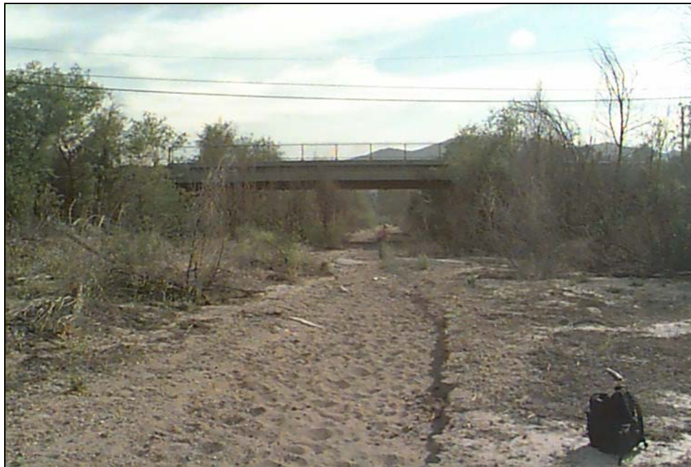
Photograph 6. Riverine habitat in Mint Canyon Creek upstream from Vasquez Canyon Road bridge. View west/southwest. 15 May 2001.

A Riverine system includes all wetlands and deepwater habitats contained within a channel, with two exceptions: (1) wetlands dominated by trees, shrubs, persistent emergents, emergent mosses, or lichens; and (2) habitats with water containing ocean-derived salts in excess of 0.5‰. The non-active, unvegetated, primary channel of Mint Canyon Creek, observed within the Riverine system throughout the vicinity of the proposed water main project, is further classified as Riverine Intermittent Sand Streambed. The Intermittent subsystem of the Riverine system exists where the channel contains nontidal flowing water for only part of the year. When active flows are not present, surface water may be absent or water may remain in isolated pools. The Streambed class includes all wetlands contained within the Intermittent subsystem of the Riverine system. Riverine Intermittent Streambed varies greatly in substrate and form depending on the gradient of the channel, velocity of the water, and sediment load. In most cases, streambeds are not vegetated because of the scouring effect when moving water is present, but they may be colonized by pioneering annuals and perennials during periods of low flows, or they may be too scattered to qualify as an Emergent or Scrub/Shrub Wetland. (Cowardin et al. 1979.)