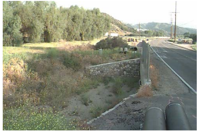
Photograph 3. Ephemeral drainage crossing site along Vasquez Canyon Road. View east/northeast. 8 May 2001.

The proposed water main construction activities will be conducted in Mint Canyon Creek and within adjacent areas inhabited by Riparian Woodland. The water main installment project, within the vicinity of the Mint Canyon Creek portion of the project site, includes a maximum impact area of approximately 50 feet along the length of the water main (a maximum of 25 feet along each side). Therefore, this project has potential to negatively affect existing wildlife resources on site.