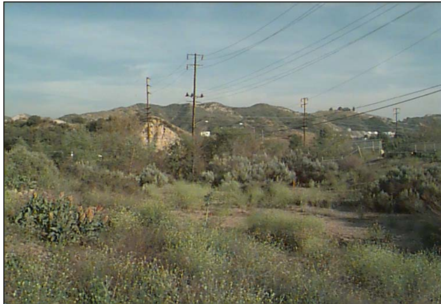
Photograph 4. Fourwing Saltbush Series vegetation on north side of Mint Canyon Creek. View north/northeast from Vasquez Canyon Road. 15 May 2001.

Fourwing Saltbush Series, in the vicinity of the Vasquez Canyon project site, exists on the lower gradual rocky slopes and on the flat areas along the creek fringes. This saltbush scrub forms an intermittent to open shrub canopy less than 2 meters tall, and is adapted to both upland and wetland habitats of elevations between 75 meters below sea level to 2,200 meters (246 feet below to 7,218 feet) (Sawyer and Keeler-Wolf 1995).