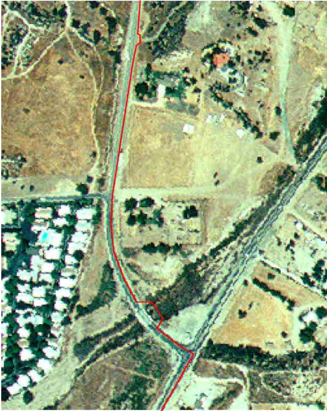
Figure 2. Aerial Photograph of Project Site Stream Crossings

The proposed water main then heads north/northwest on Vasquez Canyon Road for approximately 1.47 mile, and intersects Mint Canyon Creek (Figure 3, Aerial Photograph of Proposed Water Main Crossing Mint Canyon Creek at Vasquez Canyon Road) at the approximate coordinates of 34°27.29' north latitude, 118°25.223' west longitude; or, NE¼, SW¼, SE¼, S2, T4N, R15W; and at approximately 1,702 feet in elevation. The water main will end on Vasquez Canyon Road at the approximate coordinates of 34°28.264' north latitude, 118°25.956' west longitude; or, at the western border of the SW¼, NW¼, SW¼, S35, T5N, R15W; and at approximately 1,939 feet in elevation.