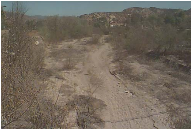
Photograph 2. Mint Canyon Creek crossing site along Vasquez Canyon Road. View east/northeast. 8 May 2001.